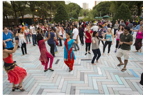
Participants gather for a Bollywood dance lesson in Chicago's SummerDance 2017 festival (photo courtesy of the City of Chicago).